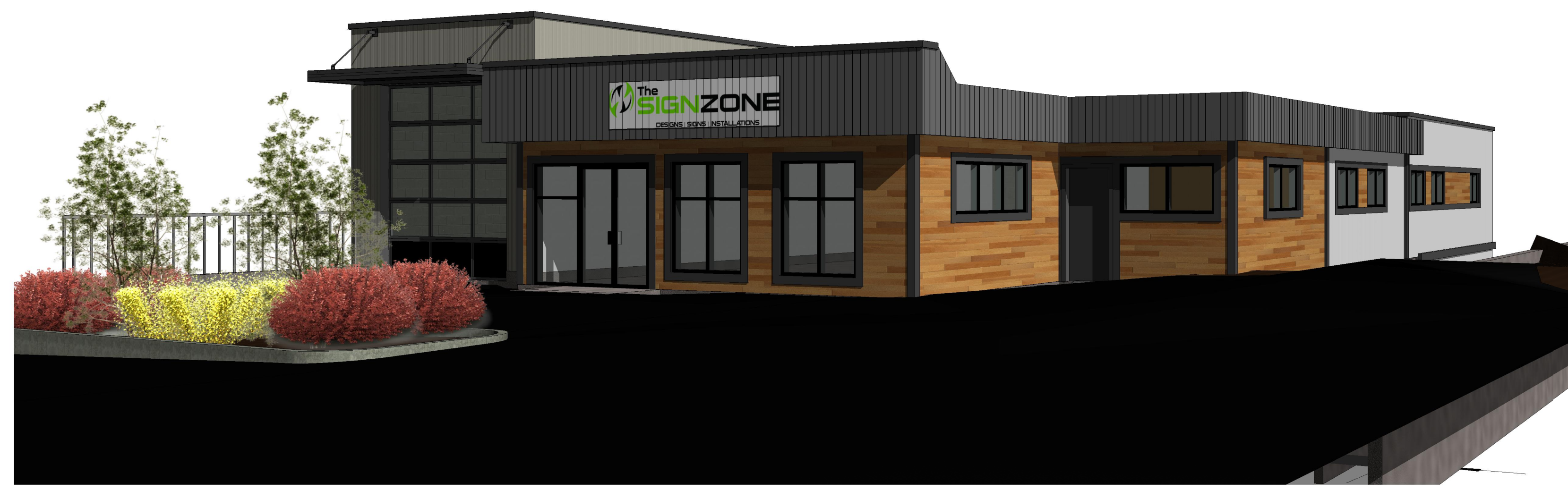
2 3D View 1