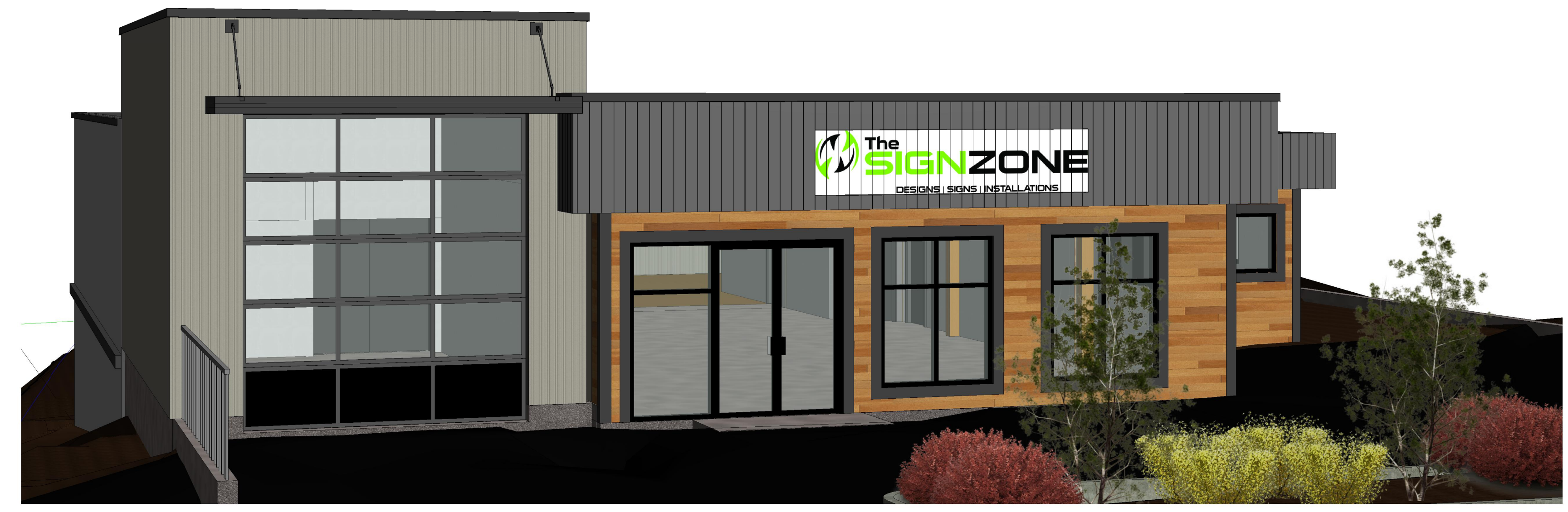
3 3D View 2